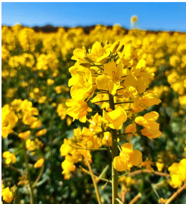
Rapeseed in Flower

Trinity Times is the newsletter of Trinity Church, Park Lane, Knebworth, Herts, SG3 6PD