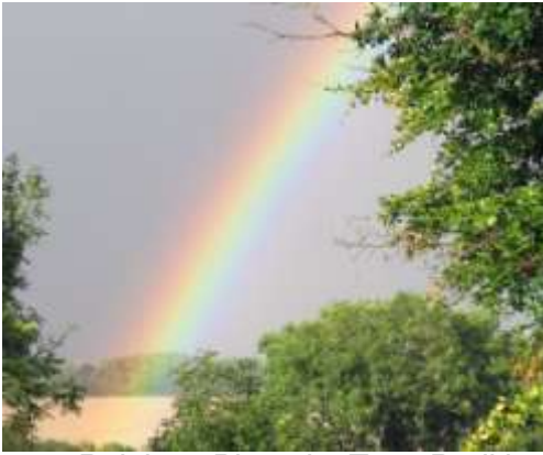
Rainbow

Many of you know how special rainbows are to me. I attended a weekend at High Leigh and our theme was “Colours of the rainbow”. It was at times a hard call, but our leader had put so much feeling into exploring the Bible through the different colours and we were truly blessed. After the retreat I found these words to a familiar hymn. I wonder if you can guess what it is? Below I share the words with you. You can either choose to sing it (why not) or use it as a prayer for yourself or others you know who are in need of some HOPE