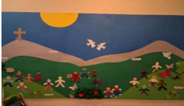
At the end of the day